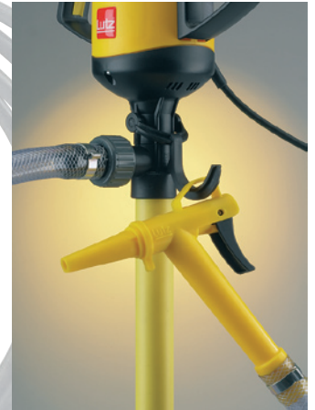
Mounted hanger for storing nozzle and cable at the pump