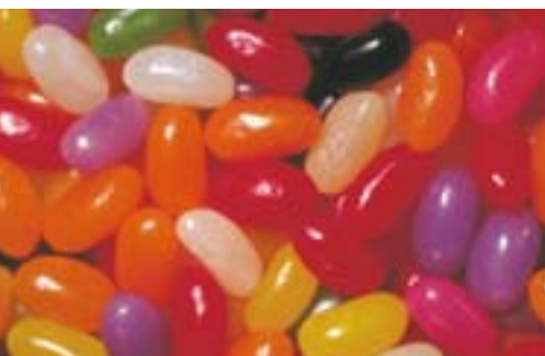
One pump for many applications: production of jellied sweets...