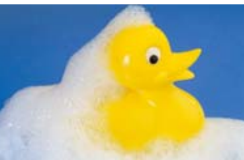
proportional blending of liquid ingredients for soap...