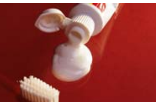
metering of colours, flavours, or preservatives