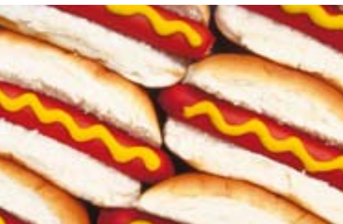
transfer of mustard and other viscous products...